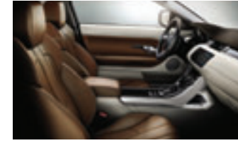
Spirit Theme (Tan/Ivory/Espresso with Ivory contrast stitching)