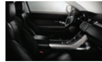
Vibe Theme (Ebony/Ebony with Ivory contrast stitching)