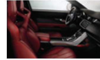
Agility Theme (Pimento/Ebony with Ebony contrast stitching)