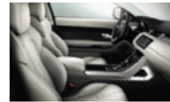
Element Theme (Cirrus/Lunar with Lunar contrast stitching)