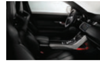
Velocity Theme (Ebony with Cirrus contrast stitching)